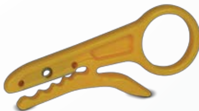
OPTI-FLOAT® Optical Cable Stripper