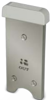
OPTI-FLOAT® Heavy Duty Cable Cutter